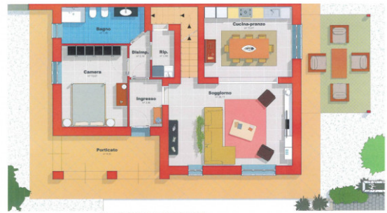
PIANO TERRA ARREDATO